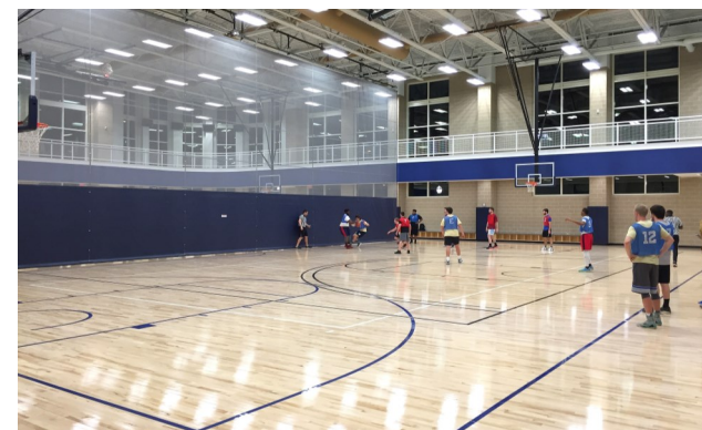
McGee Activity Center

$65 per-camper online registration $75 per-camper mail-in or day of camp